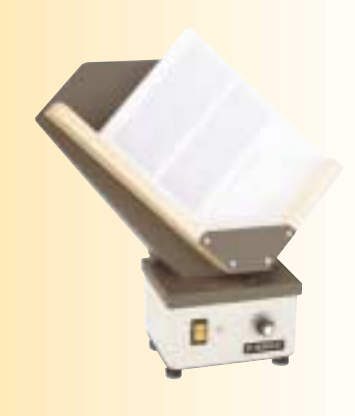
The FD 400 Jogger is a recommended option that reduces static electricity from forms and aligns them for proper feeding.

U.S. Patents 5,772,841, 5,865,925, 5,968,308 & 6,264,592 Other Patents Pending