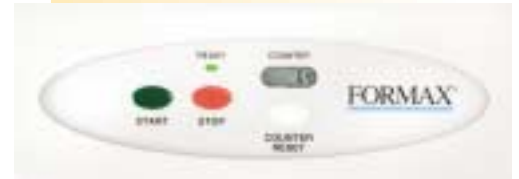
FD 1500 Control Panel

The FD 1500 is built with proven Formax technology. Heavy-duty steel construction offers the dependability and power expected of a larger unit in a smaller package. A processing speed of up to 85 forms per minute enables an operator to complete daily jobs in no time.