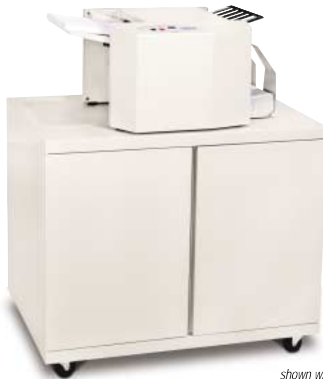
shown w/ optional cabinet

The FD 1500 AutoSeal is The low volume folder/sealer solution for processing one-piece pressure sensitive mailers. Built with proven Formax technology the FD 1500 provides an economical solution with the quality and reliability you have come to expect from Formax. The sleek office design and ease of operation makes this unit ideal for processing documents in an office environment with low volume applications. A processing speed of up to 85 forms per minute enables operators to complete daily processing jobs with ease. The added capability of processing 14" forms gives the FD 1500 the versatility needed to fold and seal virtually any low volume application to meet your needs.