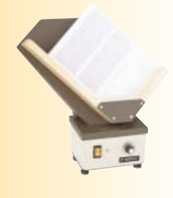
The FD 400 Jogger is a recommended option that reduces static electricity from forms and aligns them for proper feeding.

U.S. Patents 5,772,841, 5,865,925 & 5,968,308 Other Patents Pending